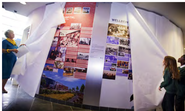
Heritage mural unveiling